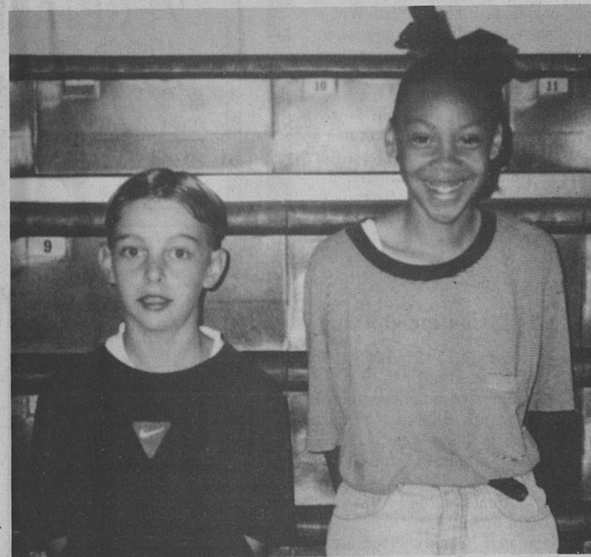
APC Festival art winners

P.S. I have friends here I know will H-E-L-P.